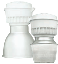
Petrolux® III Series (PWL - Large)