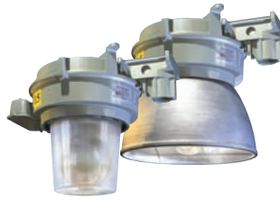
Petrolux® III Series (P3M - Medium)