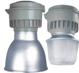
Petrolux® III Series (P3L - Large)