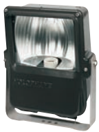
Predator® (Classified Location)