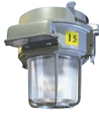
Petrolux® III Series (P3S - Low Profile)