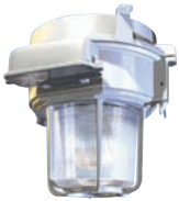
Petrolux® III Series (PWS - Low Profile)