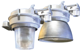
Petrolux® III Series (PWM - Medium)