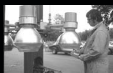
1970s: THE REVOLUTIONARY HIGH MAST SYSTEMS Holophane develops the first lighting system to raise and lower for ground-level servicing.